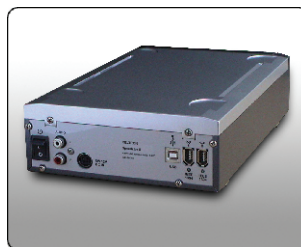
Speedzter 5 back panel